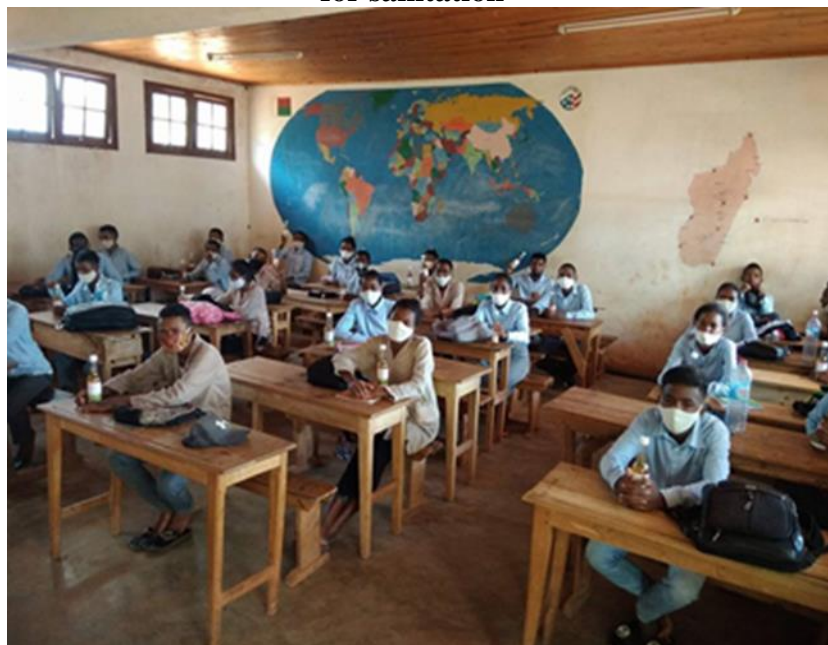
Figure 3: Distribution of CVO to each student 13