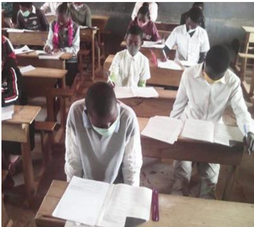
Figure 4: In the Tsiroanomandidy CISCO 14 , the senior students (BEPC level) carry out examination essays with medical protection and physical distance in the classroom 15

To better sustain and keep the learning interests of students, the MoE produced the number of 636,000 books called “liberal arts or booklet-essentials” (Figure 5) that financed by UNICEF and distributed those books to students in almost all twenty-two regions in Madagascar that aim to allow and strengthen their self-study. For instance, in Mai 2020, different establishments such as the CEG 16 Ambanitsena, CEG, and EPP 17 Ambohimanga Rova, CEG Ambohitrandriamanjaka, and other establishments have received their shares. It is explained by the responses that these books are intended for grades 6, 7, 8, and 9. The books cover the three main subjects: Malagasy, French, and mathematics. The purpose of the Ministry of National Education and technical and vocational education in producing the books was to complement the knowledge already gained by the students and to nurture and strengthen their memory. These books also include a summary of lessons, exercises, and strategies to test student achievement through practice and correction. The availability of these books will help students to be self-sufficient during this period of crisis as the Ministry of Education and technical and vocational education has announced. As viewed that reading is very fundamental in developing self- knowledge.