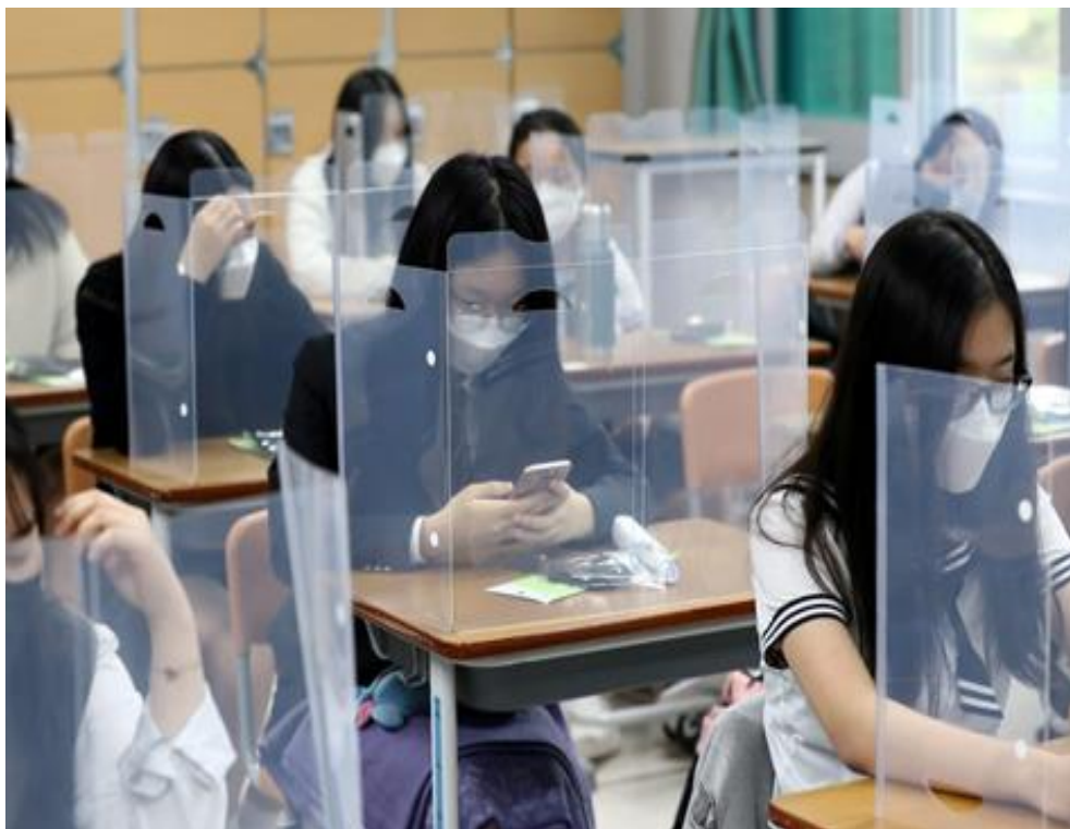
Figure 7: In South Korea, employing plastic partitions at each table of students for safety measures 20