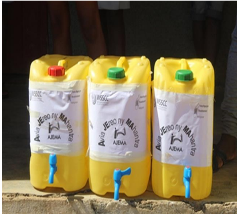
Figure 2: The schools within the country have adapted this preventive measures for sanitation 12