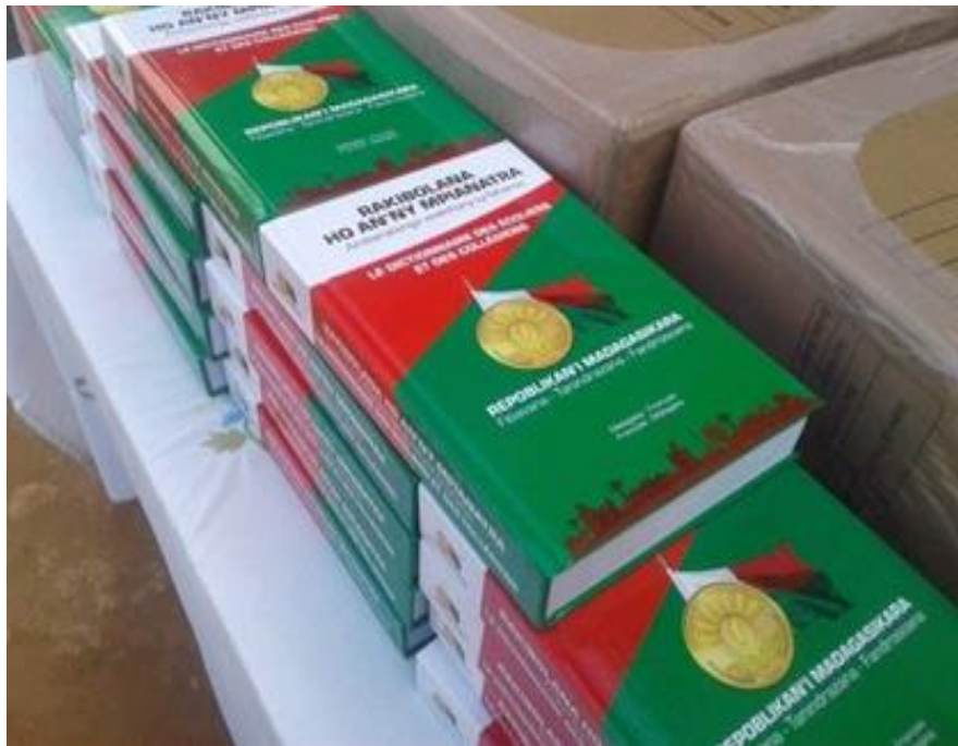
Figure 5: Learning materials that the government distribute to students 18