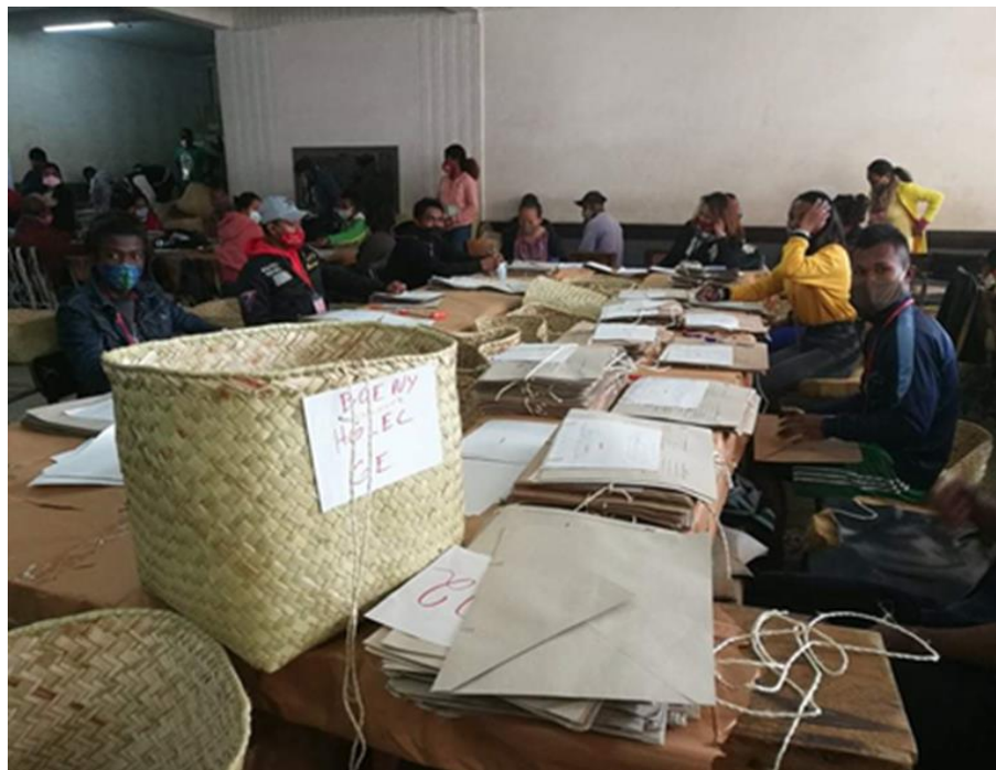
Figure 6: The education staff preparing for the CEPE and BEPC state examination subject 19